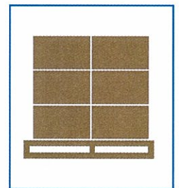
PALLET: 1000 kg (40x25kg)